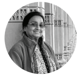
Modern Portrait oil 40 cm x 30 cm x 1 cm 2024