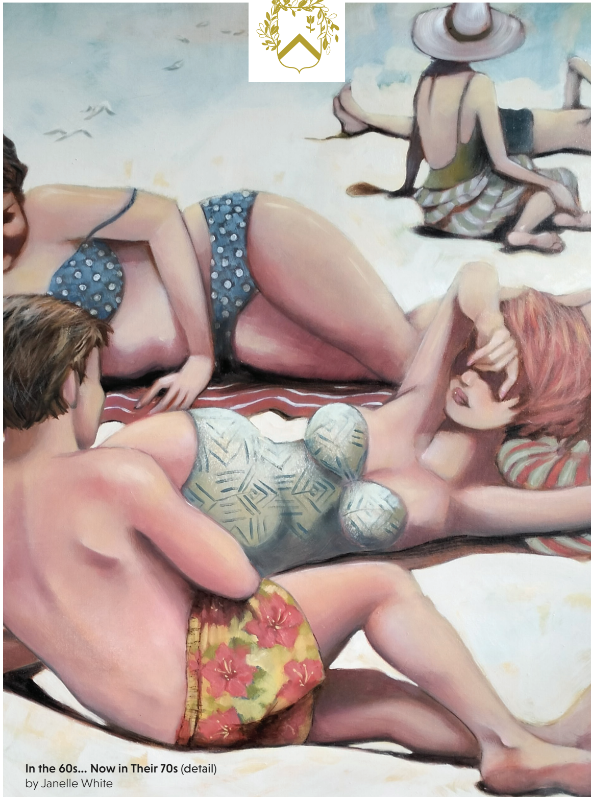
In the 60s... Now in Their 70s (detail) by Janelle White